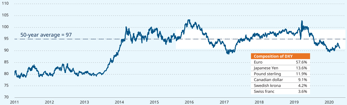
April 21, 2021

Commissions, trailing commissions, management fees and expenses all may be associated with mutual fund investments. Please read the prospectus before investing. Mutual funds are not guaranteed, their values change frequently and past performance may not be repeated.