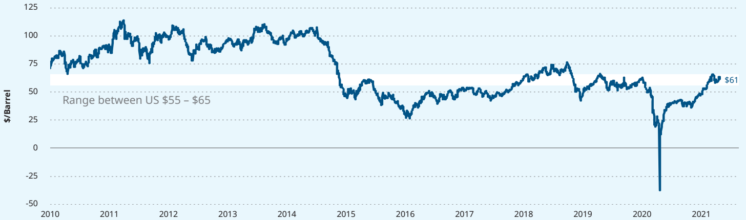
WTI crude oil spot (US$/bbl)